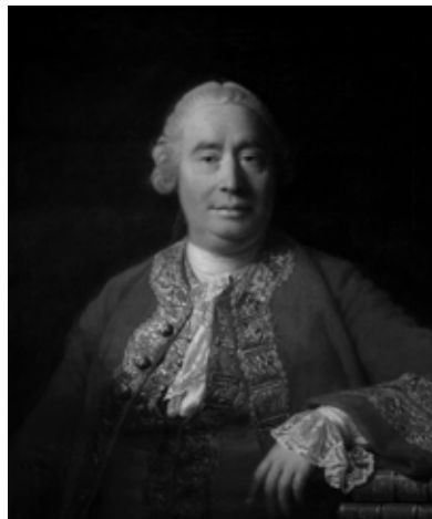
Figure 1. David Hume (Allan Ramsay, 1766)

His form of naturalism—poetic naturalism (after David Hume)—is just normal atheistic naturalism, but he adds that man has responsibility and freedom (p. 21): “The world exists; beauty and goodness are things that we bring to it.” He means there is nothing intrinsically good or beautiful. He writes that there are “No causes,