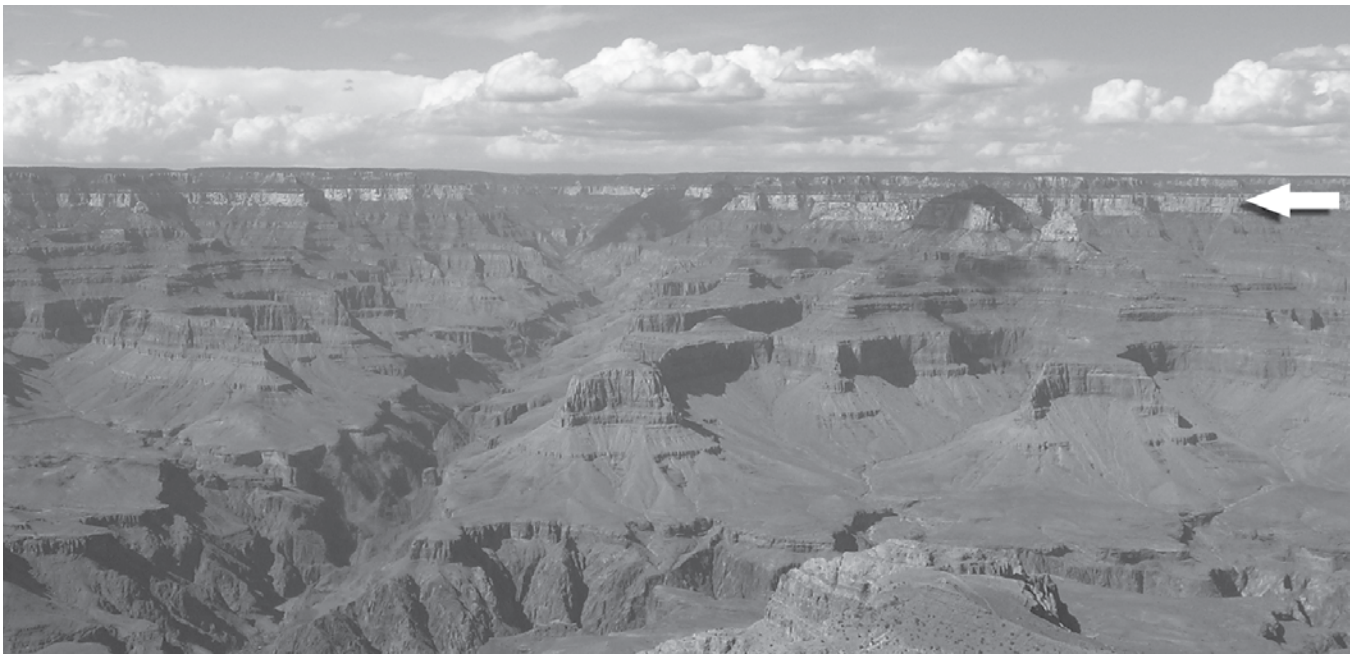
Figure 1. Grand Canyon is one of the best places in the world to see over 1,200 m of rapidly deposited Flood layers over a large area. Because of shifting and slowing currents, and particles of different mass, shape and density, layers formed quickly. Arrow shows the Coconino Sandstone near the top.

For those who attempted it, Bible-believing scholars of the time did run into difficulties relating geological observations to the Flood, but much of this was due to ignorance of, and a few wrong concepts, about the Flood. If they had held onto the Bible and the Flood at the time, I am sure these geological issues would eventually have resolved themselves. For instance, one wrong belief of the 1700s and 1800s, which the authors also believe and which persists widely to this day, is that the Flood was so chaotic that sedimentary layers would be rare. They thought that fossils and sediments should be mixed up into a confusing mess. The Flood was of course violent at times and places, but there would be a definite order to the processes that took place during the Flood year. Also, water flowing over