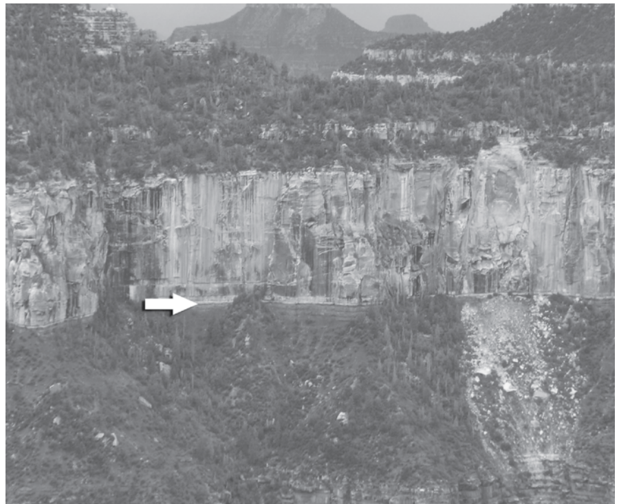
Figure 2. Closeup of the contact between the Coconino Sandstone and the subjacent Hermit Shale below (arrow) looking southwest from near the North Rim Lodge. Ten million years is missing at this widespread, dead flat contact.

Although there are legitimate challenges to the Creation/Flood model, many of the authors’ geological challenges have reasonable creationist answers. I will mention only one more geological challenge that the authors believe demonstrates uniformitarianism and deep time. These are “desert deposits”, especially